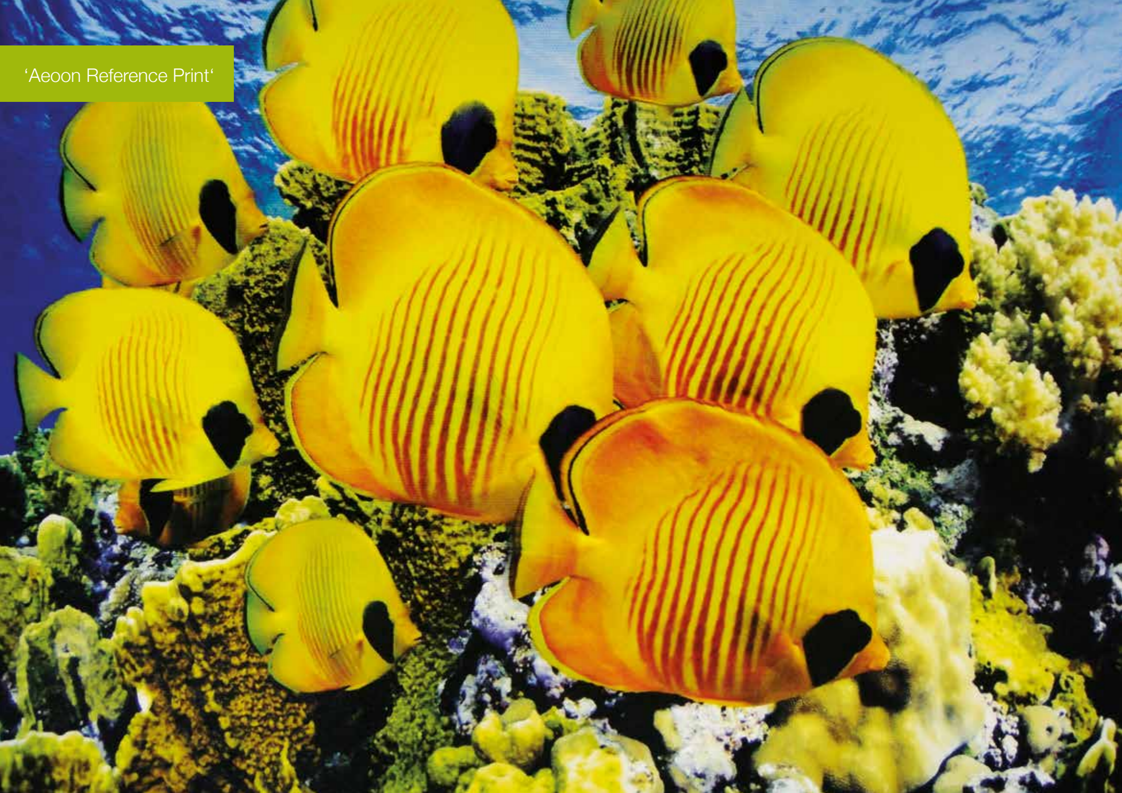
'Aeoon Reference Print'